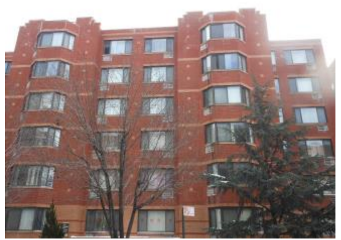
The Benjamin/140 Franklin (Queens)