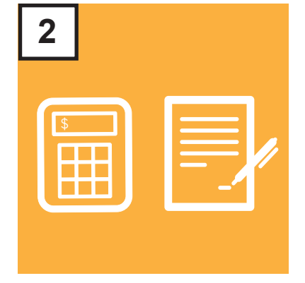
Learn About Eligbility and Application Requirements