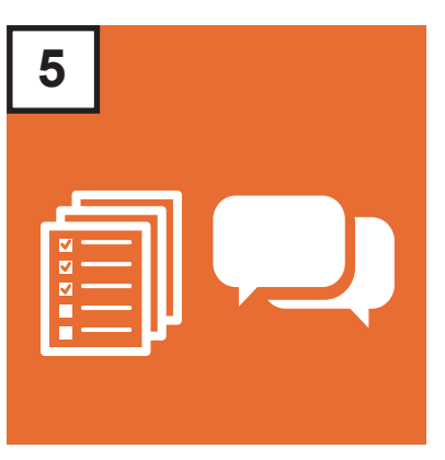
If Selected, Go to Your Interview with Documents

Sign a lease, appeal, or apply to others