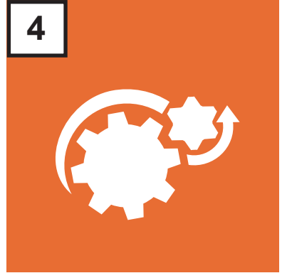
It May Take 2 to 10 Months to Hear Back