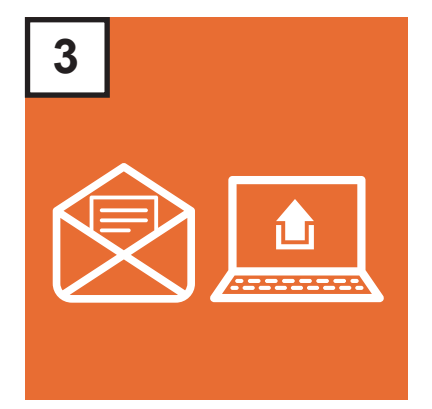
Mail Your Application or Register and Submit Online